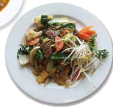
Top: Panaeng Curry. Bottom: Pad Ki Mow.

Although everyone had their favorites, nobody could find anything negative to say about any of the dishes. You even feel moderately healthy having eaten there, thanks to the wide variety of vegetables that are served as part of the dishes. The service is attentive, and your water glass rarely dips below half full. Entrees range from $11-15.