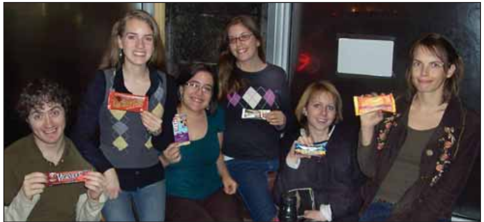
The NCVA taste test crew.