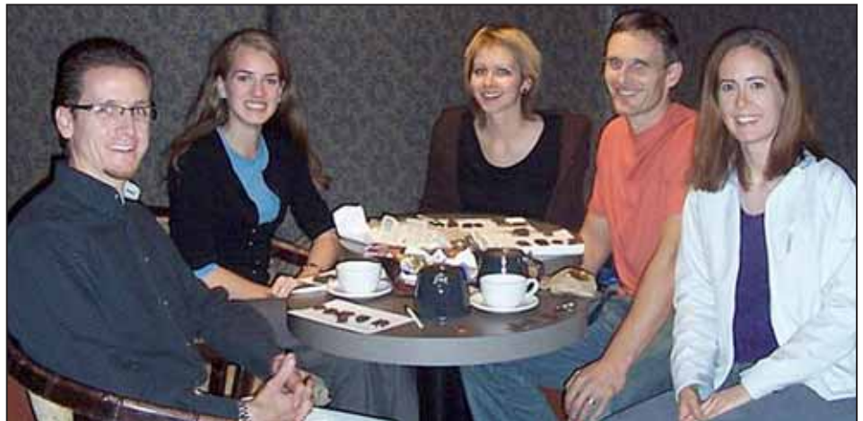
The NCVA taste test crew.

Most of the judges had never heard of Rapunzel brand previously, which is