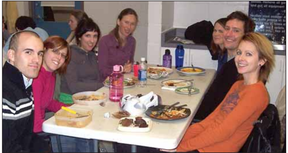
Seek out other vegetarians and vegans to spend time with, like at NCVA potlucks, so you don't feel like the only vegetarian around.

Support for “free-range” animal agriculture and the idea of “better” or “more humane” conditions for the animals does not have anything to do with animal rights, but rather animal welfare. Animal welfarism says that it is okay to use animals as long as certain standards are followed with respect to their welfare before they are killed, while animal rights mean that animals should have the right to live out their lives on their own terms. This starts with the right not to be considered someone’s property, for while animals are property, people can do whatever they like with them including killing them for personal or economic use. The property owner’s right to make the most of his or her property will always take legal precedence over the interests that the animal