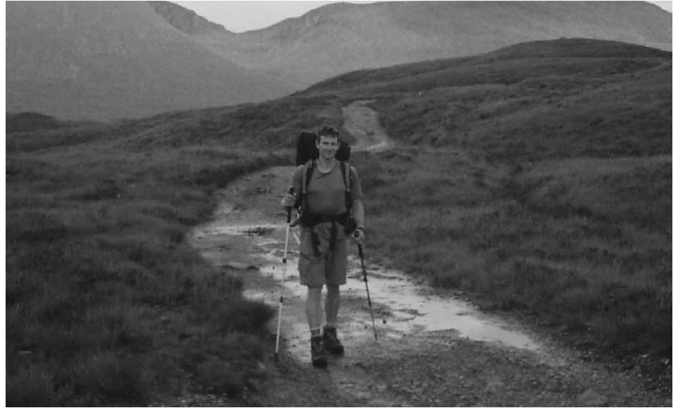
Being vegan on a 152 km hike was easy, it just required some advance planning.

We left the rest up to chance in Scotland! Fortunately in Milngavie there was an excellent grocery store where we stocked up