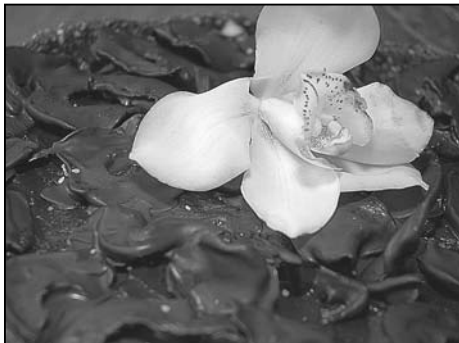
"Cocoa Gone Loco" pie.